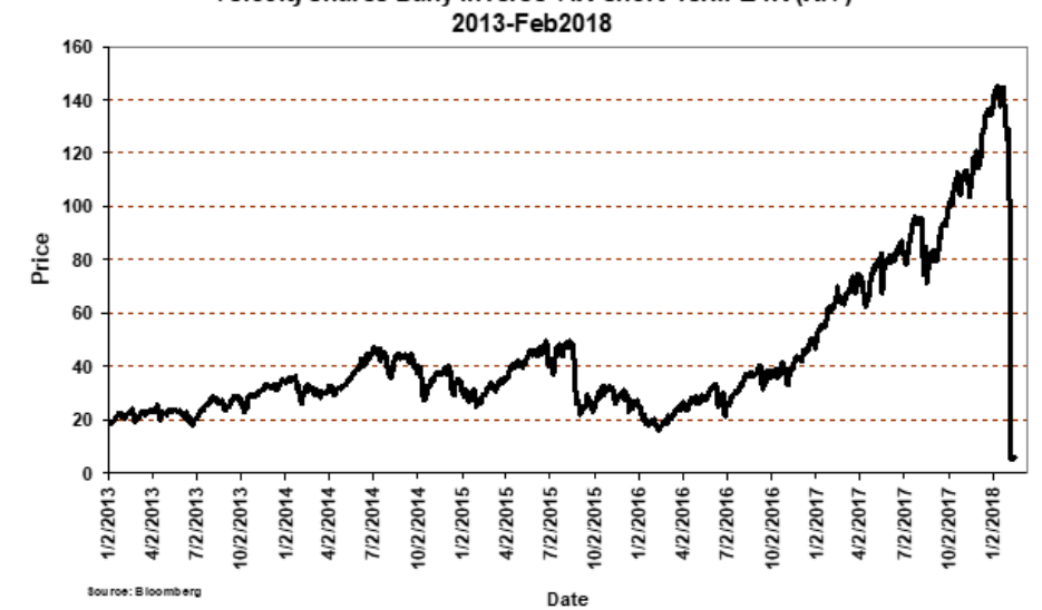
Figure 3 Velocity Shares Daily Inverse VIX Short-Term ETN (XIV)

of it as a "feedback loop." Either way, the idea that changes in asset prices can fuel even larger changes in asset prices is how you get to irrationally-high or irrationally-low price levels.